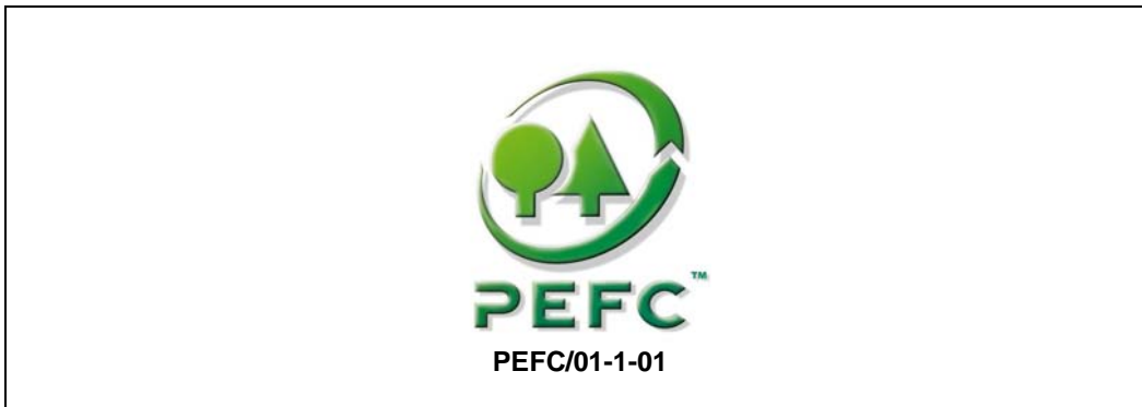
Figure 3 PEFC-Label

The specific rules for the use of the trademarks are presented in Annex 5 (PEFC Logo Usage Rules) . The rules specify: